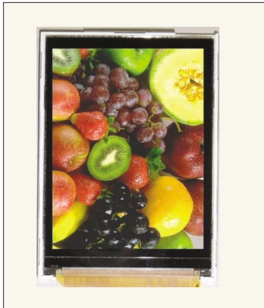
■ Photograph 1 Display Example