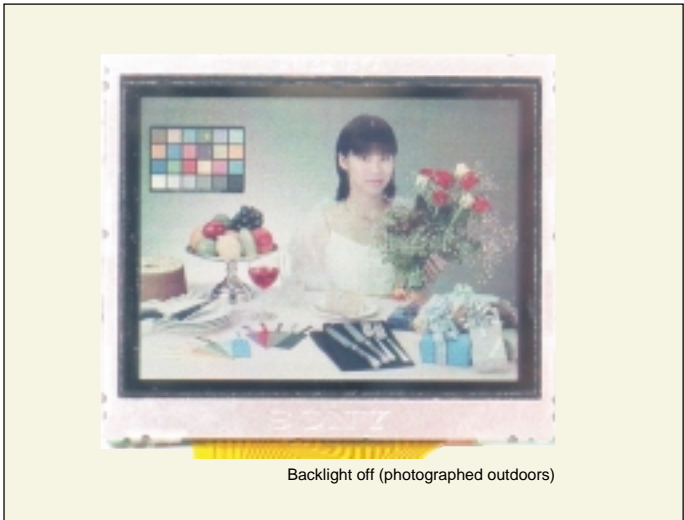
■ Figure 3 High Reflectivity